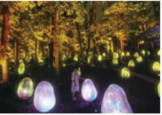
teamlab: Resonating Life in the Acorn Forest, Tokorozawa, Saitama